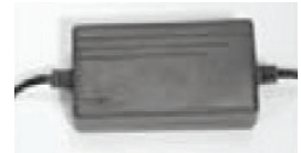
Charger (located at one end of the rail)