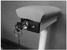
Key lock (optional)