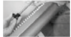
Manual hand crank